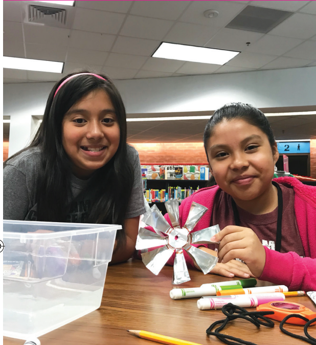
WATER RESOURCE ENGINEERS

GIRLSTART GIRLS, WHAT AN AWESOME YEAR OF GIRLSTART AFTER SCHOOL! WE HOPE YOU'VE HAD FUN BEING BRAVE, CREATIVE, AND CURIOUS AS YOU LEARNED EVEN MORE ABOUT STEM. AT GIRLSTART, WE ASPIRED TO GIVE YOU A CHANCE TO TRY NEW THINGS, MAKE FRIENDS, AND DREAM BIG ABOUT YOUR FUTURE GOALS. THANK YOU FOR BEING PART OF GIRLSTART AFTER SCHOOL THIS YEAR. HAVE A GREAT SUMMER!